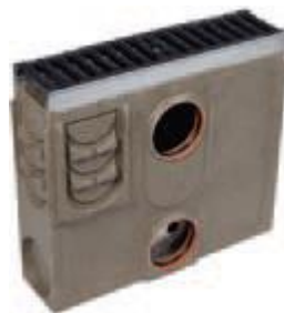
Sump Unit 500mm